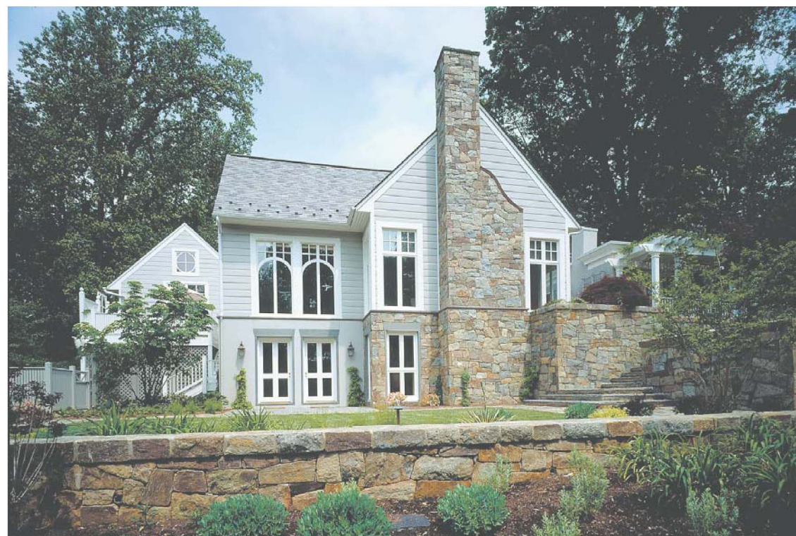
One trend for 2011 is more efficiency, which can include spectacular windows in a major renovation like this one by BOWA, or small steps as a result of an energy audit.