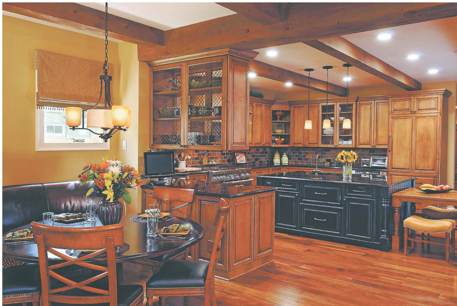
Custom wood finishes add warmth to this kitchen remodel in Potomac by BOWA.

Kitchens are the social center of our homes and need to accommodate a myriad of uses. While sometimes the solution is adding square footage, particularly in homes built 30 or more years ago, frequently the solution lies in re-thinking the layout and improving the connection to surrounding spaces, both interior and exterior. In one BOWA project, the wall separating the formal dining room from