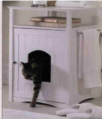
THIS WASHROOM CABINET DESIGNED BY MERRY PRODUCTS ALLOWS KITTY HER PRIVACY AND CLEVERLY DISGUISES HER LITTERBOX, WHICH IS HOUSED INSIDE. THE CLASSICALLY DESIGNED CABINET IS AVAILABLE IN WHITE, ESPRESSO AND WALNUT TO MATCH ANY WASHROOM STYLE.