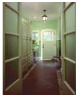
Floor plan modifications allowed for this gracious family foyer.

"The goal of this renovation was to convert an ordinary suburban house into a rich, yet unassuming, home that highlights the client's style. Ultimately, the main living areas were transformed