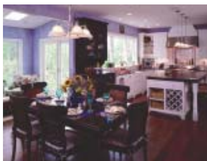
Larger windows and a new morning room bring life to the formerly closed-in kitchen.

more natural light. In the family room, a monotone brick wall gave way to the warmth of a natural stone fireplace flanked by custom built-ins accommodating a television and dual-accessed firewood storage. The family room now opens to the kitchen with the interest of low bookcases, decorative columns and an arched entry. Faux finishes, wainscoting, textured glass and bronze and crystal door hardware provide the finishing touches."