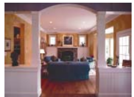
An arched entry, columns and built-in bookcases open the family room to the adjoining kitchen.