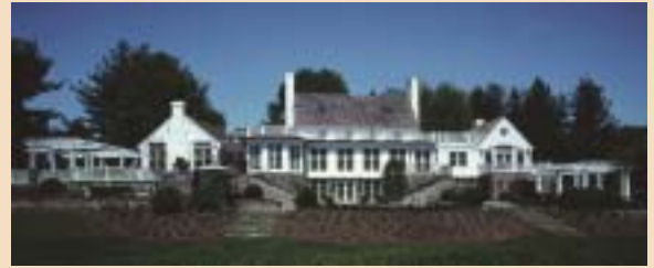
Rear elevation depicts the full grandeur of the outdoor renovation.

"The design envisioned was for a rear addition that would unify a deceptively large house that had been renovated and added to a number of times. The grand gesture was a pair of sweeping stone stairs that connected main-level elevated terraces with a new pool and lush landscape. By establishing graceful transitions between the inside and out, the house finally took full advantage of one of the finest lots in Potomac. The rear addition, stairs and pool combined to create a new sense of symmetry. The unifying concept was a truly rare level of rich detail: fine stonework and exterior trim, custom art glass panels to disguise skylights and soften the effect in the sun room, and impeccable bar room/media room paneling. The overall effect is that every touch seems duly considered. While we are proud of our design, the project also benefited from a talented interior designer and landscape architect, a client with a keen eye and a dedicated construction team."