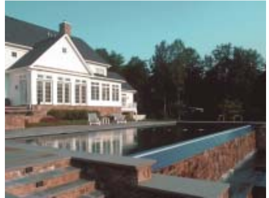
Extensive terracing highlights this disappearing-edge pool and nicely transitions the yard to the barn and pasture beyond.

While the scope of outdoor renovations certainly ranges, the higher-end projects tend to pull out all of the stops. Outdoor kitchens may include conveniences, such as industrial-style stainless stoves, sinks, grills, refrigerators, trash compactors and even pizza ovens. These features are often nestled under a pavilion,