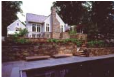
Creative use of multi-level retaining walls allows the owner to maximize this previously sloped backyard in Bethesda.

BOWA is helping its clients extend the comfort and convenience of their homes to the great outdoors. Even those with sloped, constrained or oth-