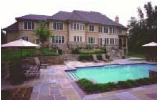
Multiple entertaining areas, including a pool, spa and tennis courts, create a resort-like atmosphere at this Virginia home.

The materials used in outdoor renovations are also getting a facelift. Whereas flagstone and pavers were once the norm, today BOWA is importing materials from around the world to create outdoor showpieces. Natural stone, such as granite, limestone and marble, give the outdoor kitchens, pavilions and pools the unique touch BOWA's clients are seeking.