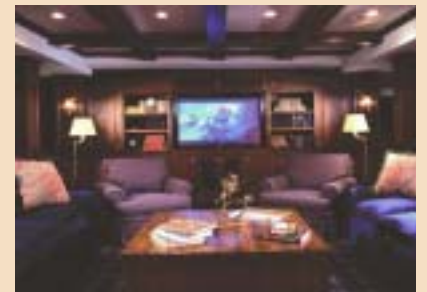
Walnut built-ins and ceiling beams create warmth in this state-of-the-art media room.