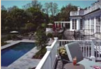
Rear terracing turned an otherwise flat lot into a luxurious space with multiple entertainment areas.

Commentary contributed by THOMAS FRENCH, AIA THOMAS FRENCH ARCHITECT