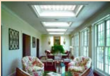
Custom art glass and integrated shades soften the look in the new sun room.

"The design envisioned was for a rear addition that would unify a deceptively large house that had been renovated and added to a number of times. The grand gesture was a pair of sweeping stone stairs that connected main-level elevated terraces with a new pool and lush landscape. By establishing graceful transitions between the inside and out, the house finally took full advantage of one of the finest lots in Potomac. The rear addition, stairs and pool combined to create a new sense of symmetry. The unifying concept was a truly rare level of rich detail: fine stonework and exterior trim, custom art glass panels to disguise skylights and soften the effect in the sun room, and impeccable bar room/media room paneling. The overall effect is that every touch seems duly considered. While we are proud of our design, the project also benefited from a talented interior designer and landscape architect, a client with a keen eye and a dedicated construction team."