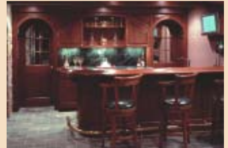
Interior stonework and hand-built walnut cabinetry complete the bar and adjoining wine cellar.